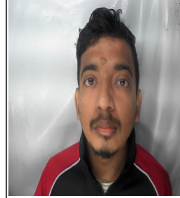
Test Day Photo