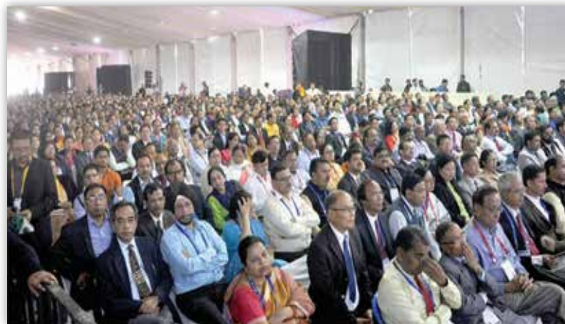
Gathering on the Inaugural Function of 105 th Indian Science Congress