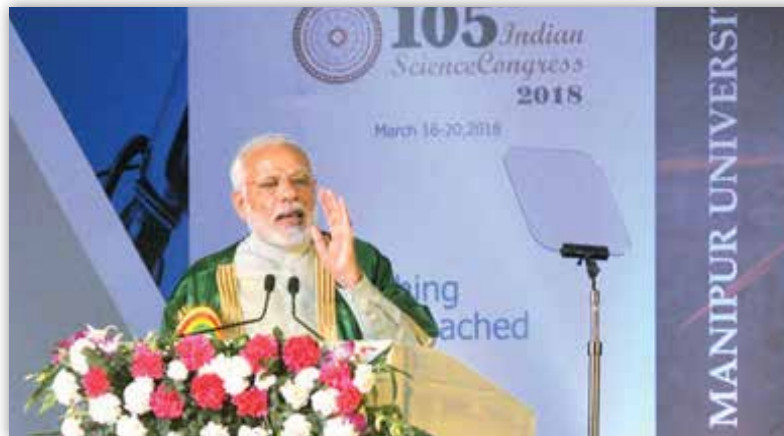
Hon'ble Prime Minister Shri Narendra Modi addressing Indian Science Congress