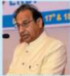
Shri Jagdish Mukhi Hon'ble Governor of Assam