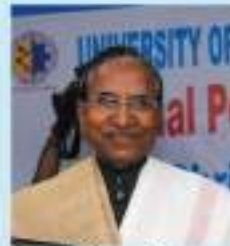
Shri Ganga Prasad, Former Governor of Meghalaya