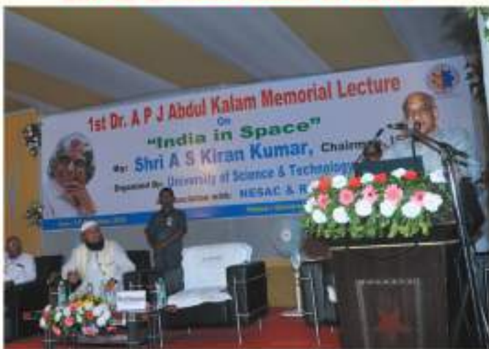
Shri A. S. Kiran Kumar addressing 1st Dr. APJ Abdul Kalam Memorial Lecture on India in Space at USTM.