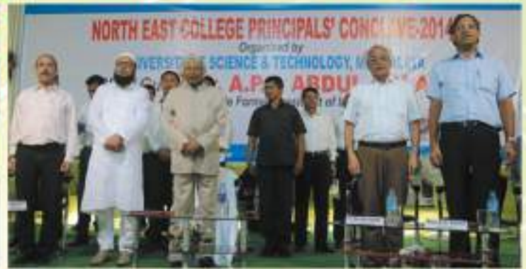
Dr. A.P.J. Abdul Kalam addressing College Principals at North East College Principal's Conclave at USTM