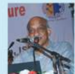
Shri A. S. Kiran Kumar Chairman, ISRO