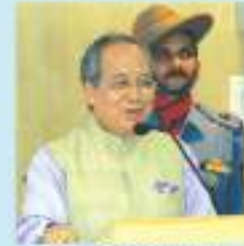
Shri R.S. Mooshahary Former Governor of Meghalaya