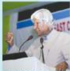
Late Dr. A.P.J. Abdul Kalam 11 th President of India