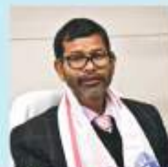
Shri Lakhmen Rymbui Hon'ble Minister of Education & Forenst, Meghalaya