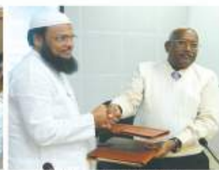
MoU signed with CSIR-North East Institute of Science & Technology, Jorhat