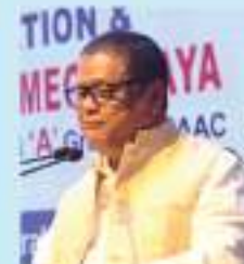
Dr. Ranaj Pegu Minister of Education Govt. of Assam