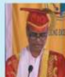
Prof. Ashutosh Ghosh VC, Calcutta University