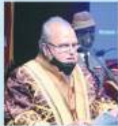
Shri Satya Pal Malik Governor of Meghalaya