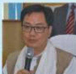
Shri Kiren Rijju Union Minister of state for Home Affairs