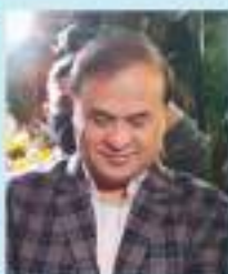
Dr. Himanta Biswa Sarma Hon'ble CM, Assam