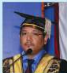
Shri Conrad K. Sangma Hon'ble CM, Meghalaya