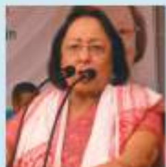
Dr. Najma Heptulla Governor of Manipur