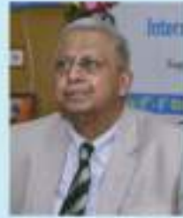
Shri Talhagata Roy Hon'ble Governor of Meghalaya