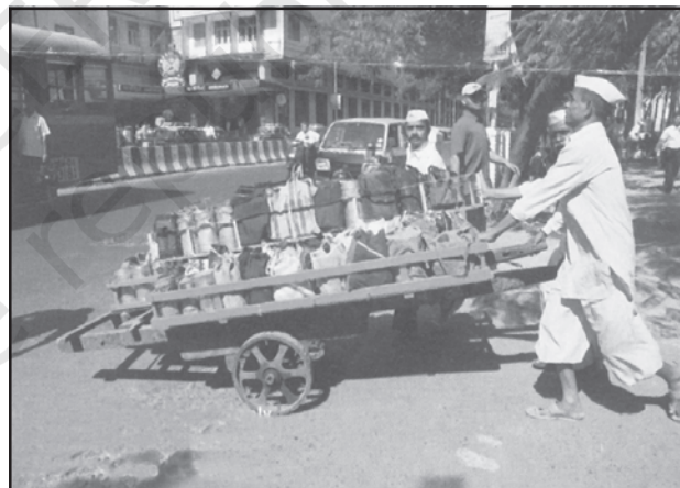
Fig. 6.4: Dabbawala Service in Mumbai

Personal services are made available to the people to facilitate their work in daily life. The workers migrate from rural areas in search of employment and are unskilled. They are employed in domestic services as housekeepers, cooks, and gardeners. This segment of workers is generally unorganised. One such example in India is Mumbai's dabbawala (Tiffin) service provided to about 1,75,000 customers all over the city.