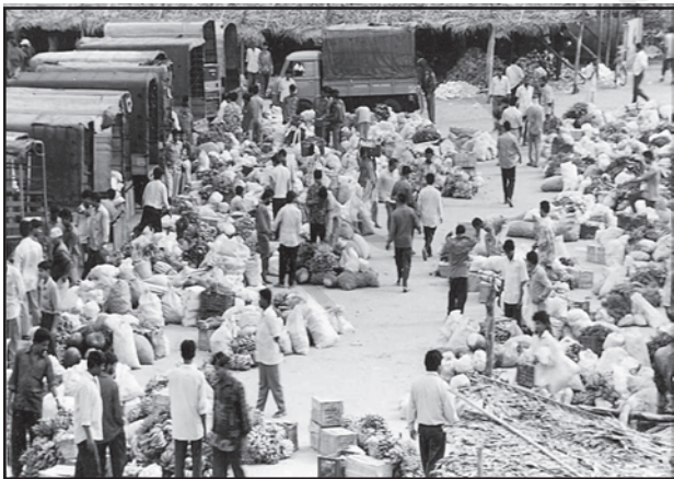
Fig. 6.2: A Wholesale Vegetable Market

Rural marketing centres cater to nearby settlements. These are quasi-urban centres. They serve as trading centres of the most rudimentary type. Here personal and professional services are not well-developed. These form local collecting and distributing centres. Most of these have mandis (wholesale markets) and also retailing areas. They are not urban centres per se but are significant centres for making available goods and services which are most frequently demanded by rural folk.