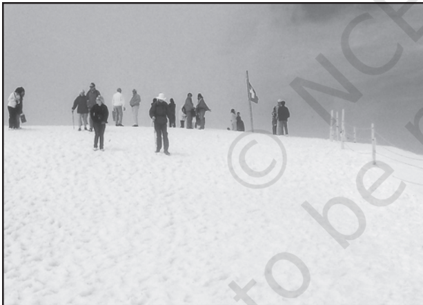
Fig. 6.5: Tourists skiing in the snow capped mountain slopes of Switzerland

Tourism is travel undertaken for purposes of recreation rather than business. It has become the world's single largest tertiary activity in total registered jobs (250 million) and total revenue (40 per cent of the total GDP). Besides, many local persons, are employed to provide services like accommodation, meals, transport, entertainment and special shops serving the tourists. Tourism fosters the growth of infrastructure industries, retail trading, and craft industries (souvenirs). In some regions, tourism is seasonal because the vacation period is dependent on favourable weather conditions, but many regions attract visitors all the year round.