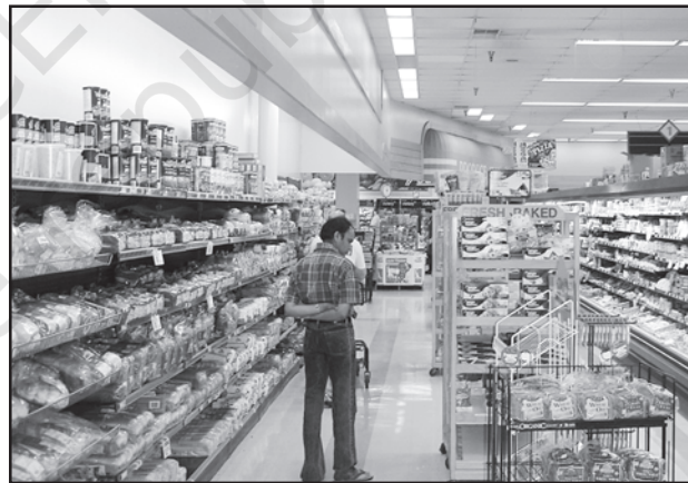
Fig. 6.3: Packed Food Market in U.S.A.

Urban marketing centres have more widely specialised urban services. They provide ordinary goods and services as well as many of the specialised goods and services required by people. Urban centres, therefore, offer manufactured goods as well as many specialised markets develop, e.g. markets for labour, housing, semi or finished products. Services of educational institutions and professionals such as teachers, lawyers, consultants, physicians, dentists and veterinary doctors are available.