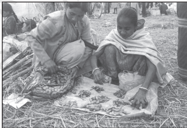
Fig. 8.1: Two women practising barter system in Jon Beel Mela

The initial form of trade in primitive societies was the barter system , where direct exchange of goods took place. In this system if you were a potter and were in need of a plumber, you would have to look for a plumber who would be in need of pots and you could exchange your pots for his plumbing service.