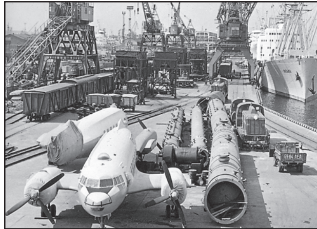
Fig. 8.4: Leningrad Commercial Port