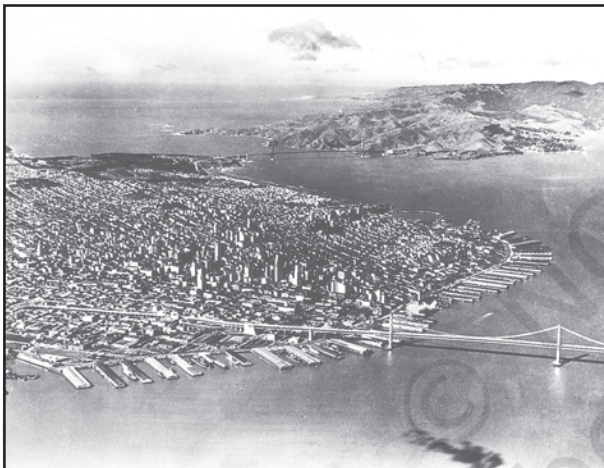
Fig. 8.3: San Francisco, the largest land-locked harbour in the world

The ports provide facilities of docking, loading, unloading and the storage facilities for cargo. In order to provide these facilities, the port authorities make arrangements for maintaining navigable channels, arranging tugs and barges, and providing labour and managerial services. The importance of a port is judged by the size of cargo and the number of ships handled. The quantity of cargo handled by a port is an indicator of the level of development of its hinterland.