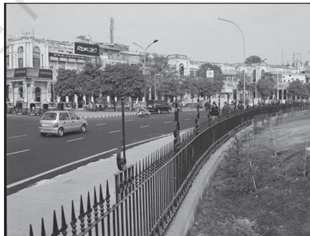
Fig. 2.4 : A view of the modern city

The British and other Europeans have developed a number of towns in India. Starting their foothold on coastal locations, they first developed some trading ports such as Surat, Daman, Goa, Pondicherry, etc. The British later consolidated their hold around three principal nodes – Mumbai (Bombay), Chennai (Madras), and Kolkata (Calcutta) – and built them in the British style. Rapidly