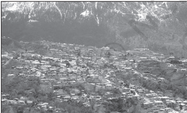
Fig. 2.1 : Clustered Settlements in the North-eastern states

The clustered rural settlement is a compact or closely built up area of houses. In this type of village the general living area is distinct and separated from the surrounding farms, barns and pastures. The closely built-up area and its