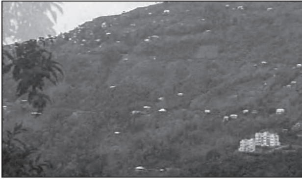
Fig. 2.3 : Dispersed settlements in Nagaland

with farms or pasture on the slopes. Extreme dispersion of settlement is often caused by extremely fragmented nature of the terrain and land resource base of habitable areas. Many areas of Meghalaya, Uttarakhand, Himachal Pradesh and Kerala have this type of settlement.