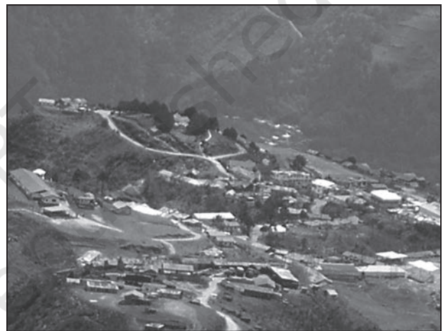
Fig. 2.2 : Semi-clustered settlements

Semi-clustered or fragmented settlements may result from tendency of clustering in a restricted area of dispersed settlement. More often such a pattern may also result from segregation or fragmentation of a large compact village. In this case, one or more sections of the village society choose or is forced to live a little away from the main cluster or village. In such cases, generally, the land-owning and dominant community occupies the central part of the main village, whereas people of lower strata of society and menial workers settle on the outer flanks of the village. Such settlements are widespread in the Gujarat plain and some parts of Rajasthan.