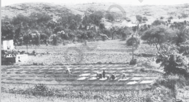
Ralegan Siddhi after mitigation approach

in agricultural operation. Landless labourers also gained employment. Today the village plans to buy land for them in adjoining villages.