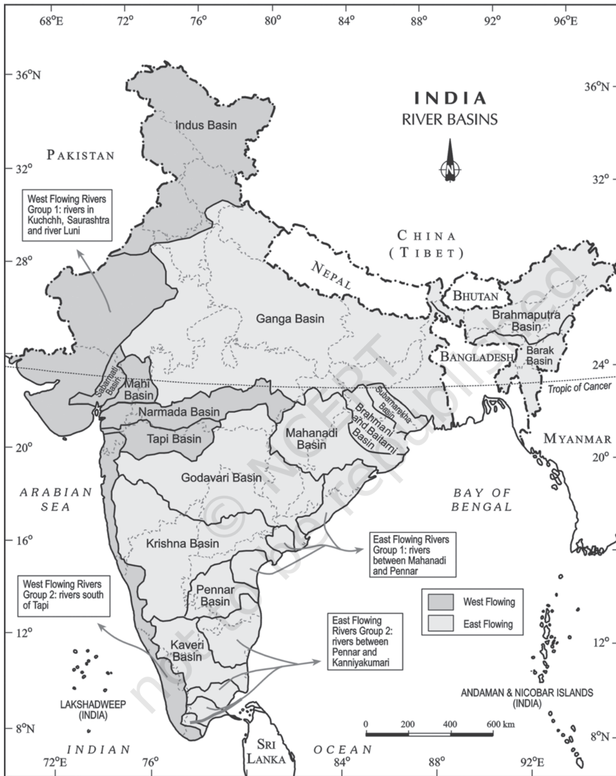
Fig. 4.1 : India - River Basins