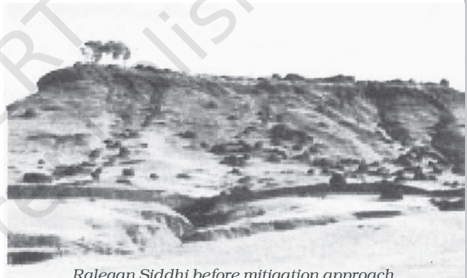
Ralegan Siddhi before mitigation approach

A Rs.22 lakh school building was constructed using only the resources of the village. No donations were taken. Money, if needed, was borrowed and paid back. The villagers took pride in this self-reliance. A new system of sharing labour grew out of this infusion of pride and voluntary spirit. People volunteered to help each other