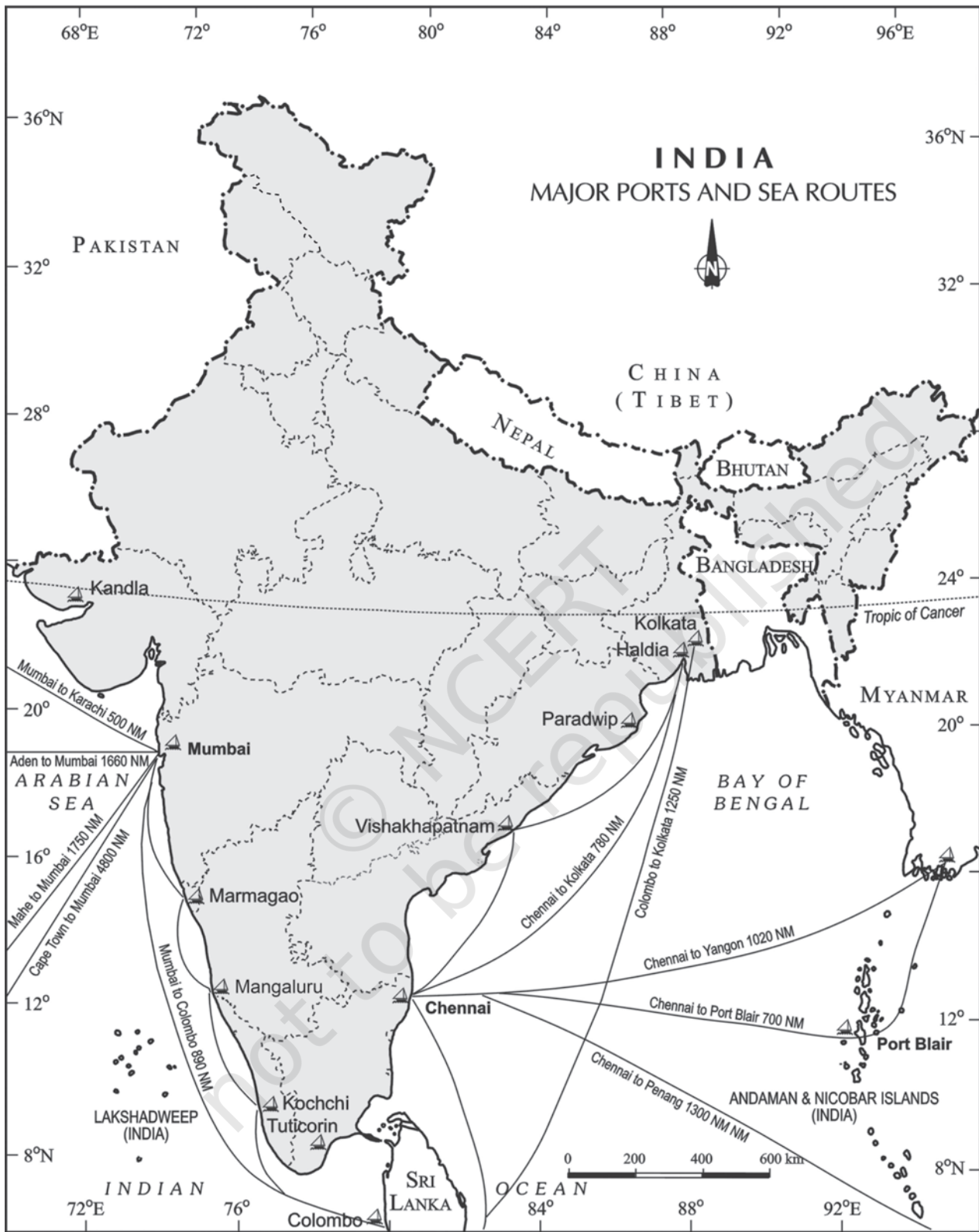
Fig. 8.4 : India – Major Ports and Sea Routes