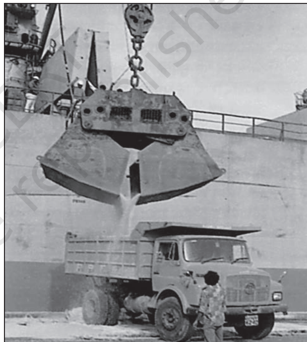
Fig. 8.3 : Unloading of goods on port

India is surrounded by sea from three sides and is bestowed with a long coastline. Water provides a smooth surface for very cheap transport provided there is no turbulence. India