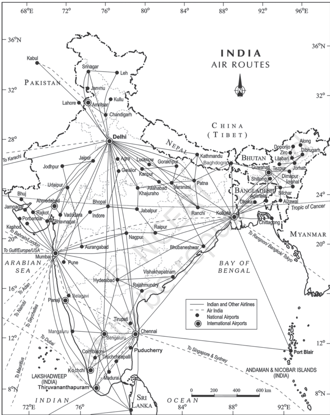
Fig. 8.5 : India - Air Routes