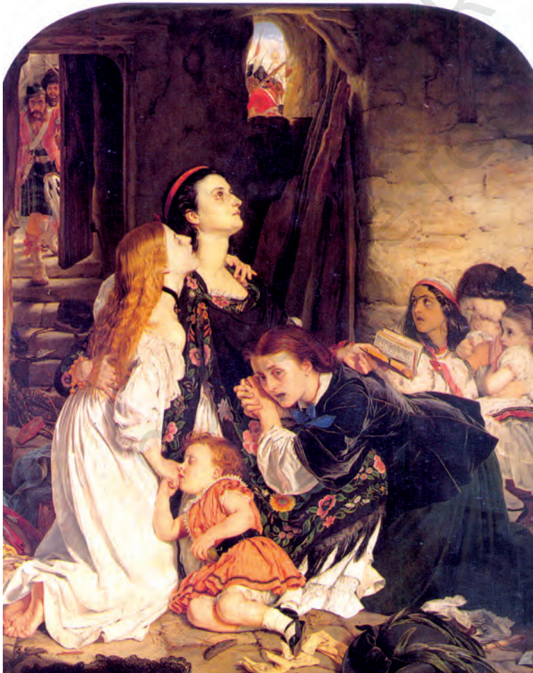
Fig. 10.11 “In Memoriam”, by Joseph Noel Paton, 1859

“In Memoriam” (Fig. 10.11) was painted by Joseph Noel Paton two years after the mutiny. You can see English women and children huddled in a circle, looking helpless and innocent, seemingly waiting for the inevitable – dishonour, violence and death. “In Memoriam” does not show gory violence; it only suggests it. It stirs up the spectator’s imagination, and seeks to provoke anger and fury. It represents the rebels as violent and brutish, even though they remain invisible in the picture. In the background you can see the British rescue forces arriving as saviours.