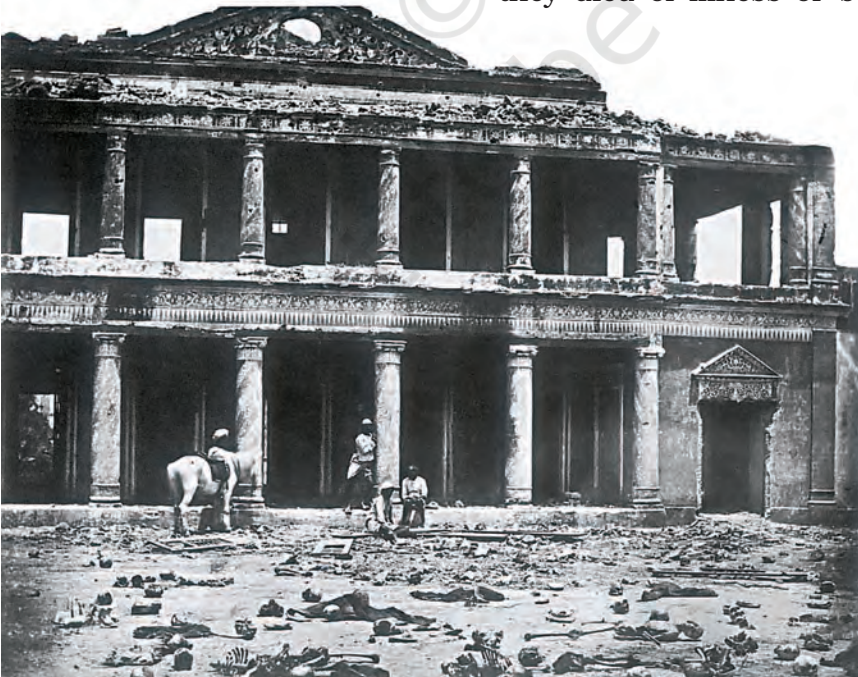
Fig. 10.9 Secundrah Bagh, Lucknow, photograph by Felice Beato, 1858

The British used military power on a gigantic scale. But this was not the only instrument they used. In large parts of present-day Uttar Pradesh, where big landholders and peasants had offered united resistance, the British tried to break up the unity by promising to give back to the big landholders their estates. Rebel landholders were dispossessed and the loyal rewarded. Many landholders died fighting the British or they escaped into Nepal where they died of illness or starvation.