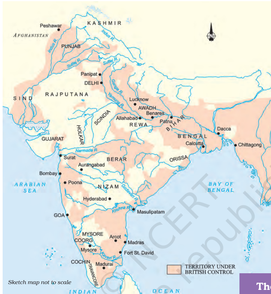
Map 1 Territories under British control in 1857