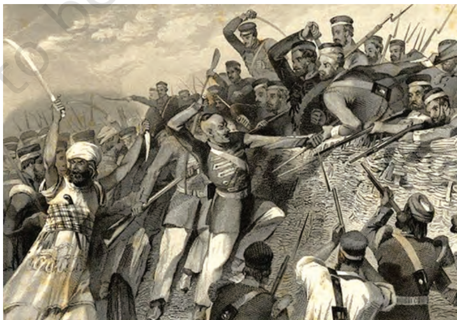
Fig. 10.2 Ordinary people join the sepoys in attacking the British in Lucknow.

Firangi , a term of Persian origin, possibly derived from Frank (from which France gets its name), is used in Urdu and Hindi, often in a derogatory sense, to designate foreigners.