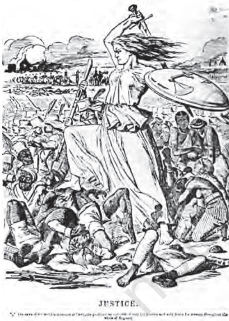
Fig. 10.13 Justice , Punch, 12 September 1857 The caption at the bottom reads “The news of the terrible massacre at Cawnpore (Kanpur) produced an outburst of fiery indignation and wild desire for revenge throughout the whole of England.”

In another set of sketches and paintings we see women in a different light. They appear heroic, defending themselves against the attack of rebels. Miss Wheeler in Figure 10.12 stands firmly at the centre, defending her honour, single-handedly killing the attacking rebels. As in all such British representations, the rebels are demonised. Here, four burly males with swords and guns are shown attacking a woman. The woman's struggle to save her honour and her life, in fact, is represented as having a deeper religious connotation: it is a battle to save the honour of Christianity. The book lying on the floor is the Bible.