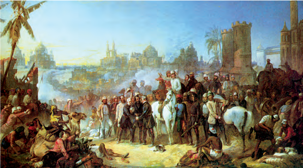
Fig. 10.10 “Relief of Lucknow”, painted by Thomas Jones Barker, 1859

was appointed as the new Commander of British forces in India, came with his forces and rescued the besieged British garrison. In British accounts the siege of Lucknow became a story of survival, heroic resistance and the ultimate triumph of British power.