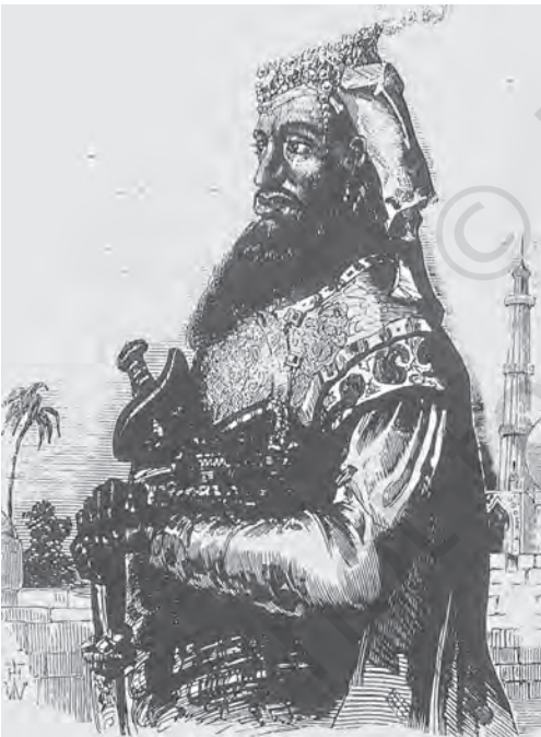
Fig. 10.4 Nana Sahib At the end of 1858, when the rebellion collapsed, Nana Sahib escaped to Nepal. The story of his escape added to the legend of Nana Sahib's courage and valour.