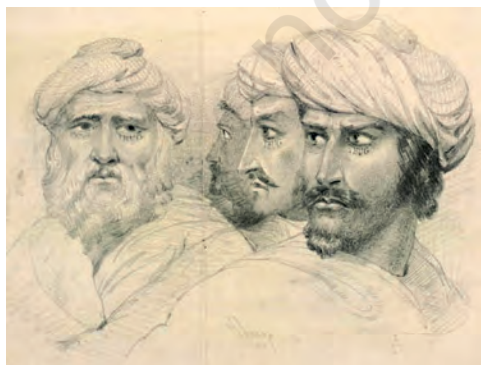
Fig. 10.19 Faces of rebels