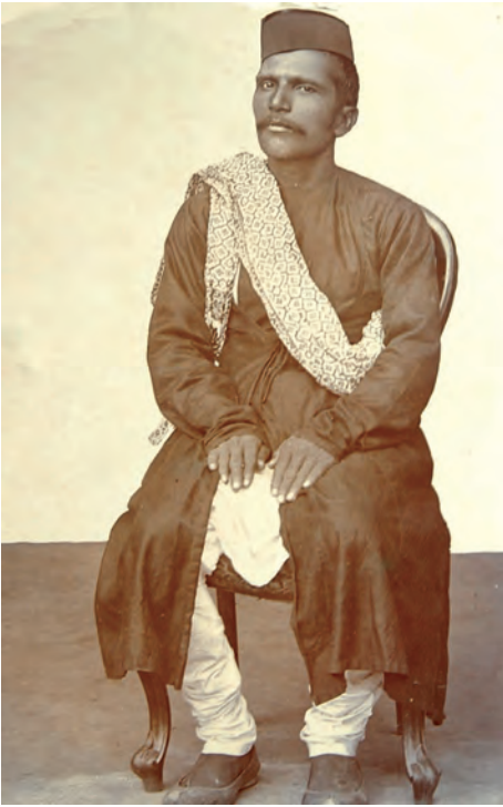
Fig. 10.6 A zamindar from Awadh, 1880

and issues, traditions and loyalties worked themselves out in the revolt of 1857. In Awadh, more than anywhere else, the revolt became an expression of popular resistance to an alien order.