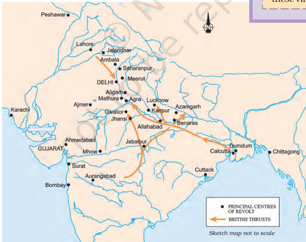
Map 2 The map shows the important centres of revolt and the lines of British attack against the rebels.

➤ What, according to this account, were the problems faced by the British in dealing with these villagers?