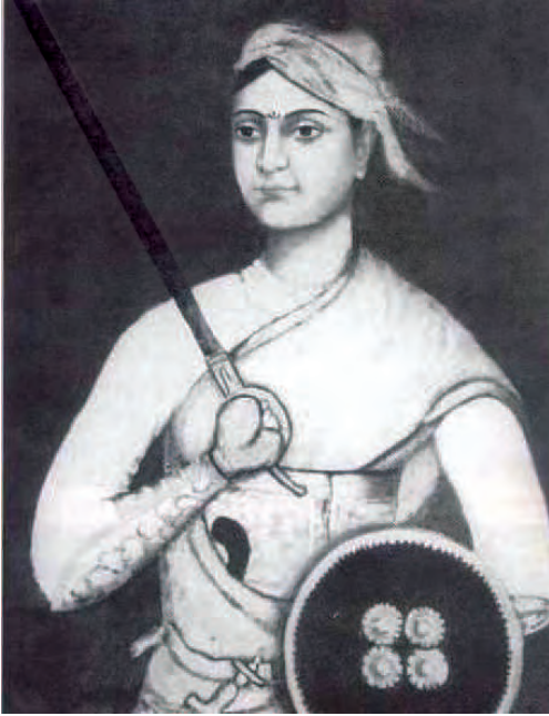
Fig. 10.3 Rani Lakshmi Bai, a popular image