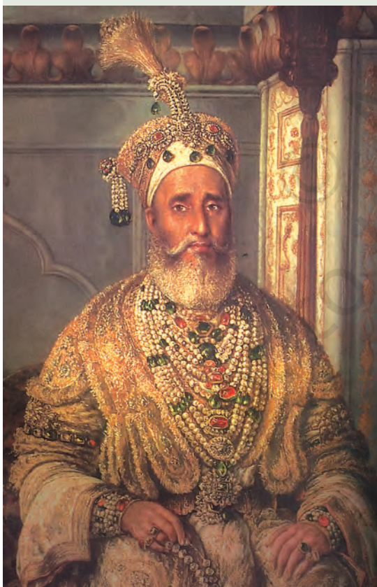
Fig. 10.1 Portrait of Bahadur Shah

Late in the afternoon of 10 May 1857, the sepoys in the cantonment of Meerut broke out in mutiny. It began in the lines of the native infantry, spread very swiftly to the cavalry and then to the city. The ordinary people of the town and surrounding villages joined the sepoys. The sepoys captured the bell of arms where the arms and ammunition were kept and proceeded to attack white people, and to ransack and burn their bungalows and property. Government buildings – the record office, jail, court, post office, treasury, etc. – were destroyed and plundered. The telegraph line to Delhi was cut. As darkness descended, a group of sepoys rode off towards Delhi.