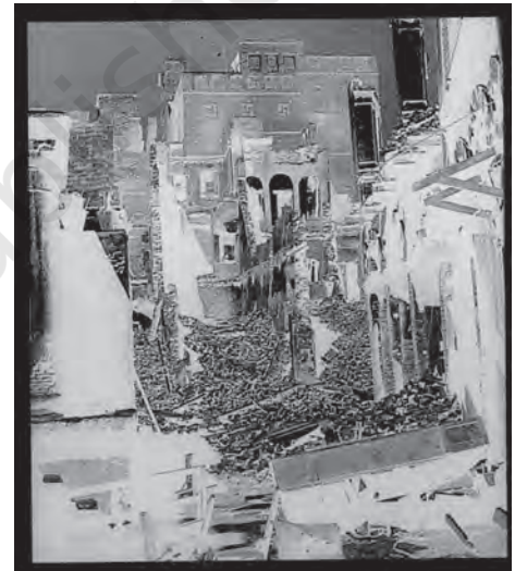
Fig. 12.2 Images of desolation and destruction continued to haunt members of the Constituent Assembly.

On Independence Day, 15 August 1947, there was an outburst of joy and hope, unforgettable for those who lived through that time. But innumerable Muslims in India, and Hindus and Sikhs in Pakistan, were now faced with a cruel choice – the threat of