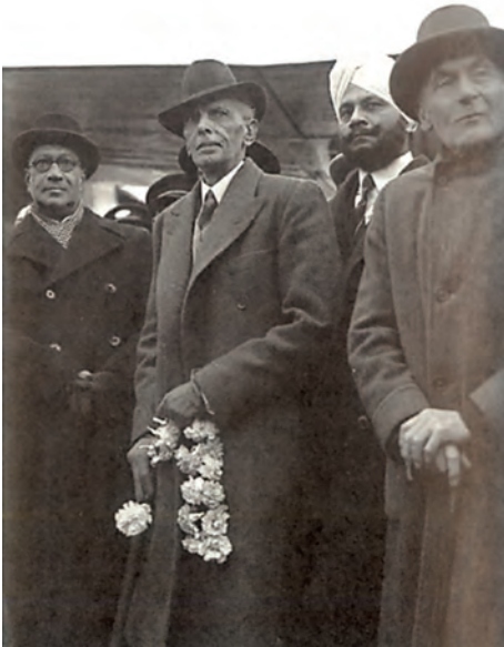
Fig. 12.8 In the winter of 1946 Indian leaders went to London for what turned out to be a fruitless round of talks with British Prime Minister Attlee. (Left to right: Liaquat Ali, Mohammad Ali Jinnah, Baldev Singh and Pethick-Lawrence)

and their views taken into account. Only separate electorates would ensure that Muslims had a meaningful voice in the governance of the country. The needs of Muslims, Bahadur felt, could not be properly understood by non-Muslims; nor could a true representative of Muslims be chosen by people who did not belong to that community.