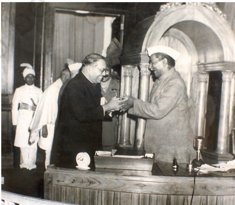
Fig. 12. 9 B. R. Ambedkar and Rajendra Prasad greeting each other at the time of the handing over of the Constitution

The Constituent Assembly debates help us understand the many conflicting voices that had to be negotiated in framing the Constitution, and the many demands that were articulated. They tell us about the ideals that were invoked and the principles that the makers of the Constitution operated with. But in reading these debates we need to be aware that the ideals invoked were very often re-worked according to what seemed appropriate within a context. At times the members of the Assembly also changed their ideas as the debate unfolded over three years. Hearing others argue, some members rethought their positions, opening their minds to contrary views, while others changed their views in reaction to the events around.