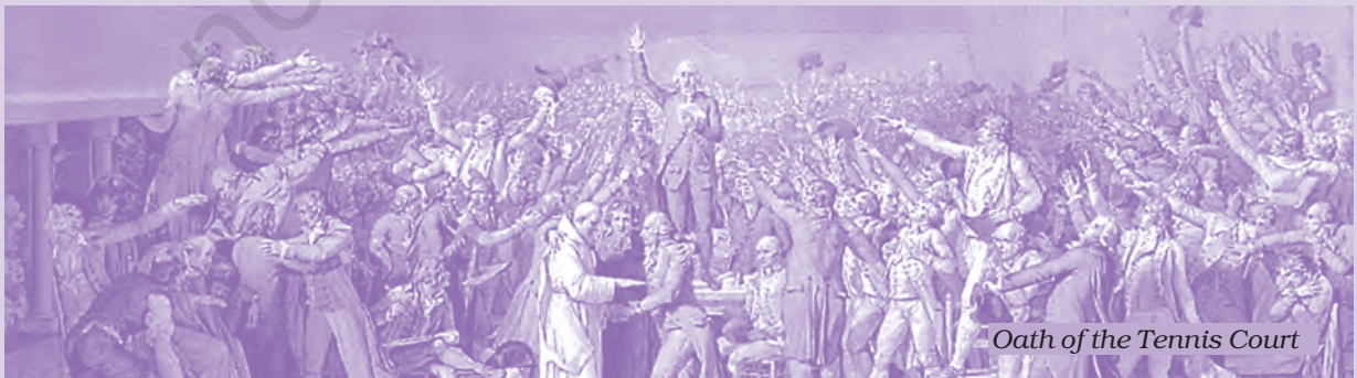
Oath of the Tennis Court

CONSTITUENT ASSEMBLY DEBATES (CAD), VOL. I