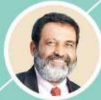
Shri TV Mohandas Pai Chairman, Manipal University Learning Pvt Ltd. and MEMG International Pvt Ltd