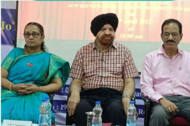
INAUGURATION OF ARTIFICIAL INTELLIGENCE RESEARCH LAB