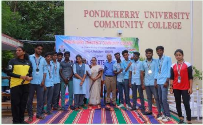
CELEBRATION OF ANNUAL SPORTS DAY