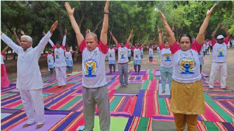
CELEBRATION OF INTERNATIONAL YOGA DAY