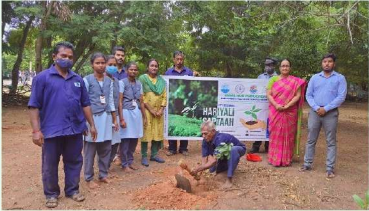
TREE PLANTATION IN THE CAMPUS