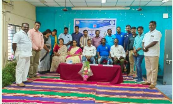
SPONSORING SANITARY PAD VENDING MACHINE BY ROTARY CLUB OF WHITE TOWN