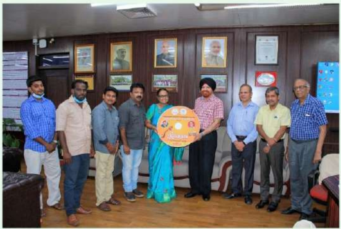
VOTING & COVID 19 AWARENESS AUDIO LAUNCH