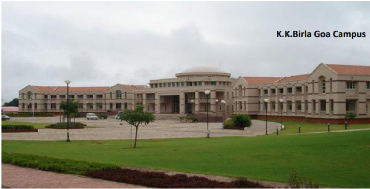
K.K.Birla Goa Campus